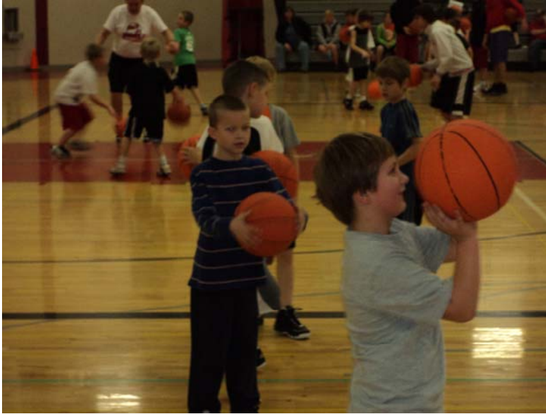
Shelton Parks and Recreation Youth Basketball League

2010 saw the Shelton Parks and Recreation Department face many challenges and experience many successes. A show of support for what the department annually accomplishes was seen with the passage of the initiative to establish the Shelton Metropolitan Park District in April. This will ensure that all city parks will remain open, maintained and safe for public use and youth and adult recreation programs will continue to be offered to provide the community with opportunities to enrich, enjoy, learn, exercise, and engage.