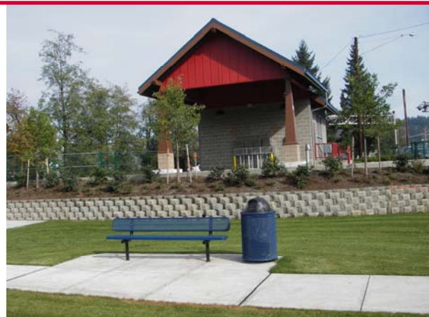
The NEW Kneeland Park Pump Station

The City is half way through upgrades and expansion of the main Wastewater Treatment Plant. The City is also preparing to restore the third of six major sewer basins in the Hillcrest/ South Hill area in 2011. This project will replace leaky sewer mains and local connections that cause flooding from rain and snow event. The addition of Kneeland Park Pump Station and these other projects will greatly improve the City wastewater management to protect the citizens, the environment, and foster future economic development.