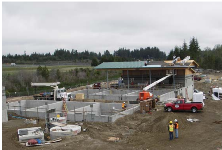
April 24, 2009—Under Construction

A prior phase included the extension of sewer and reclaimed water transmission mains from this facility to the Washington Corrections Center (WCC). Total budget for both portions of this project was $21,637,382. As of November, actual expenses were $19,253,955 and staff has projected that final project cost will be approximately $20.1M or 93% of the budgeted amount. These numbers include approximately $700,000 in reclaimed water system enhancements that were implemented after construction began. This demonstrates our ability to complete large, complex projects on time and under budget, and is helping position the City for economic development and growth as the economy recovers.