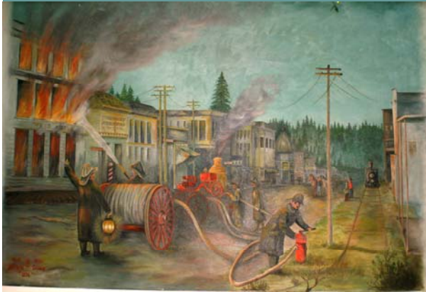
The Original Firehouse Mural

Next time you're near 2 nd and Franklin, please take a gander at the progress on the Public Safety Building renovation. This phase of the project, construction of new apparatus bays, is well underway and the building is taking form. There is also some important work going on inside the existing building; preservation of a hand painted wall mural.